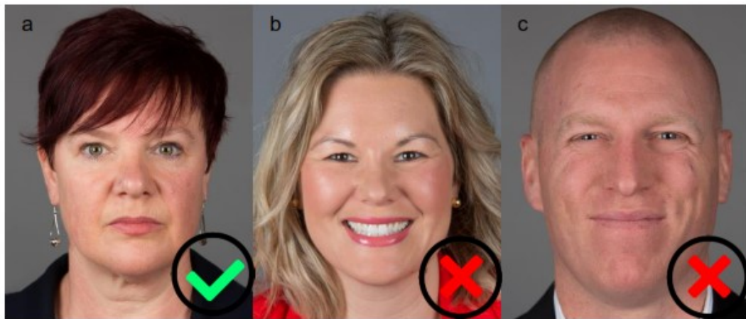
a) Compliant portrait, b) Smiling person, c) Person smiling with closed mouth.