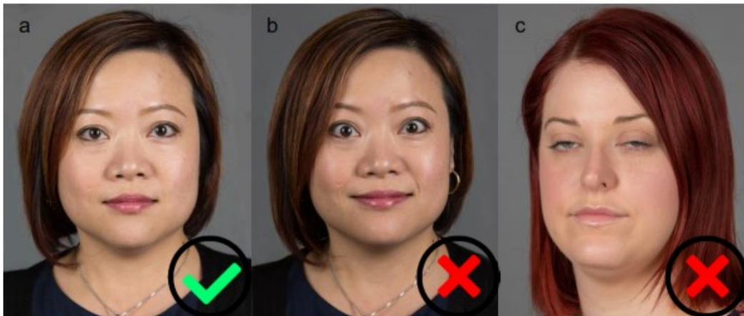
a) Compliant portrait, b) Unnaturally wide opened eyes, c) Eyes not fully opened.