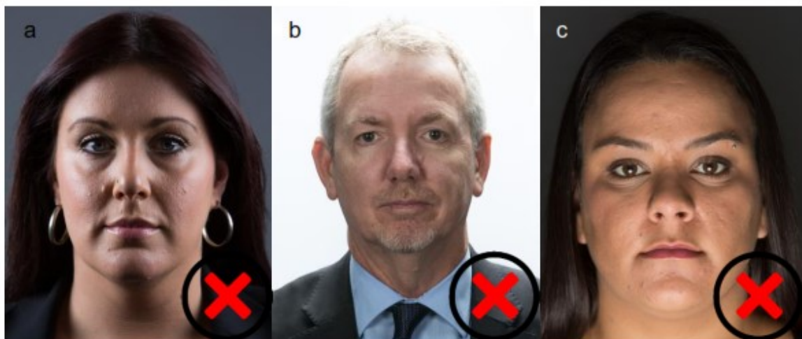
Non-compliant portraits: a) Side illumination, b) Top illumination, c) Bottom illumination.