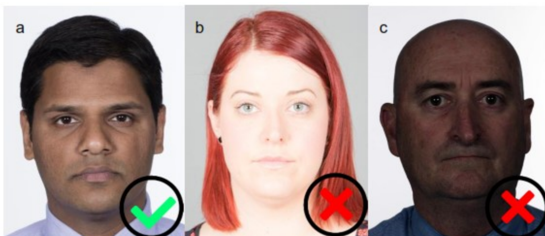
a) Compliant portrait, b) Over exposure, c) Under exposure.