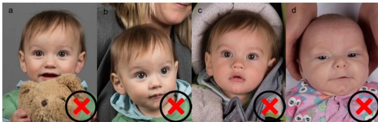
a) Toy, b) supporting person, c) Non-neutral background, d) Supporting hands.