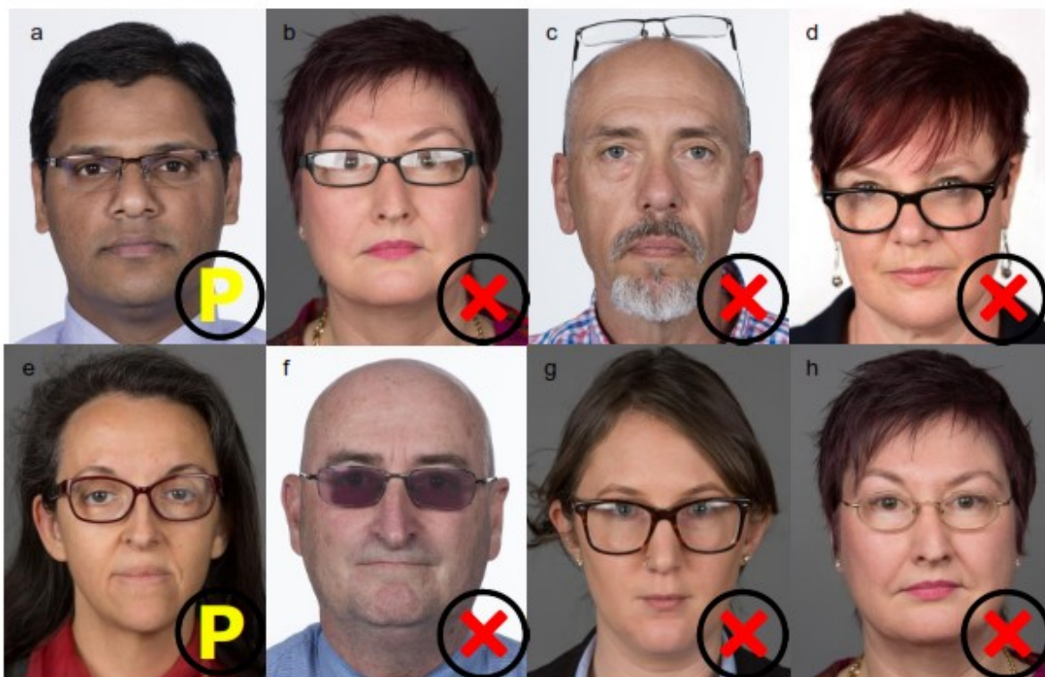
a) Compliant portrait, b) Strong reflections on glasses, c) Glasses worn on the head, d) Frame crossing the eyes, e) Compliant image, f) Sunglasses, g), h) Frames partially covering the EVZ.